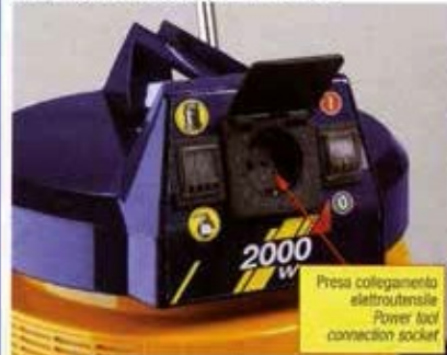
Preso collegamento elettroutensile Power tool connection socket