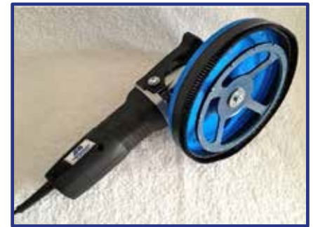
PCD DISC FOR THERMOPLASTIC AND SCRATCHED PAINTING