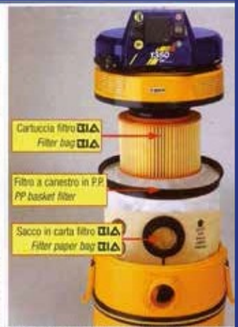
Cartuccia filtro Filter bag Filtro a canestro in PP PP basket filter Sacco in carta filtro Filter paper bag